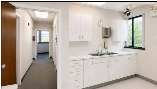
Lab or Break Room